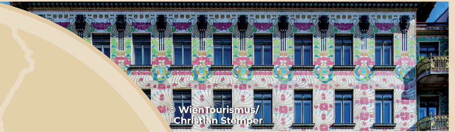
4 Majolica House Otto Wagner (1898/99), Vienna, Austria