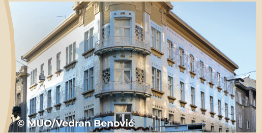
5 Kallina House Vjekoslav Bastl (1903/4) Zagreb, Croatia