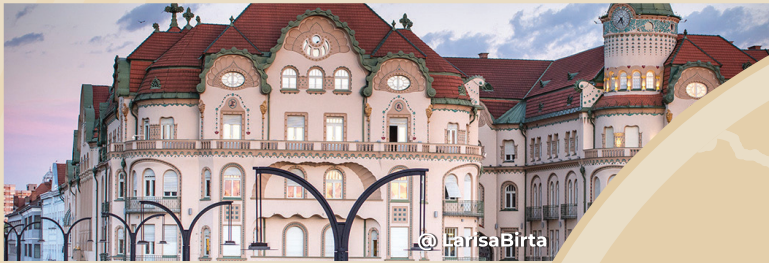
1 Black Eagle Palace Jakab Dezső and Komor Marcell, (1908), Oradea, Romania