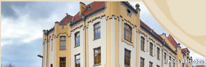
3 Royal Secondary Boy's School (Today Grammar School), Ödön Lechner (1906–08), Bratislava, Slovakia