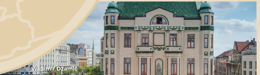
6 Moscow Hotel Jovan Ilkić (1905–1908), Belgrade, Serbia