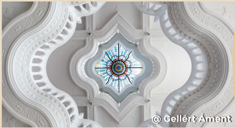
2 Museum of Applied Arts Ödön Lechner and Gyula Pártos, (1897), Budapest, Hungary